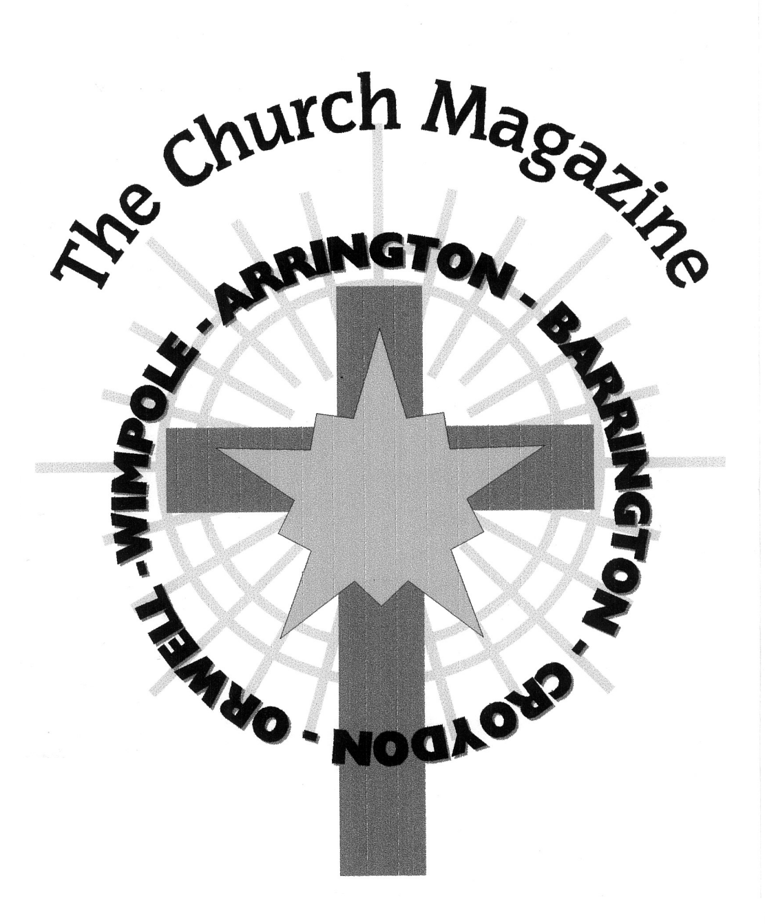
February 2021 40p