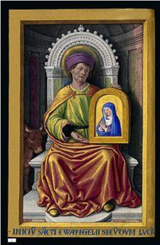
Miniature of Saint Luke from the Grandes Heures of Anne of Brittany by Jean Bourdichon

As for you, always be sober, endure suffering, do the work of an evangelist, carry out your ministry fully.